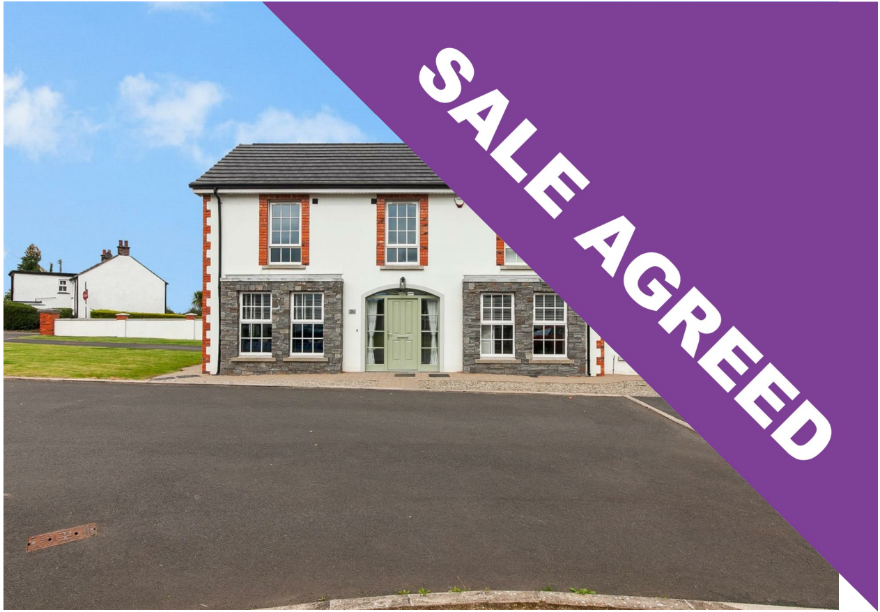
2B Lylehill Road East, Templepatrick, BT39 0HQ